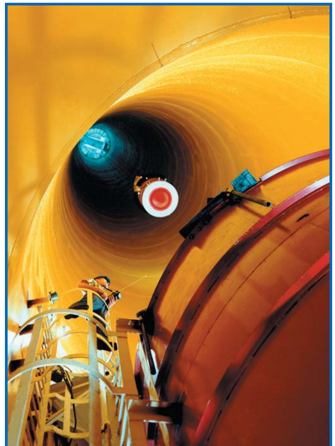
Retrieving the drop vehicle after a test in the Zero-G Facility.