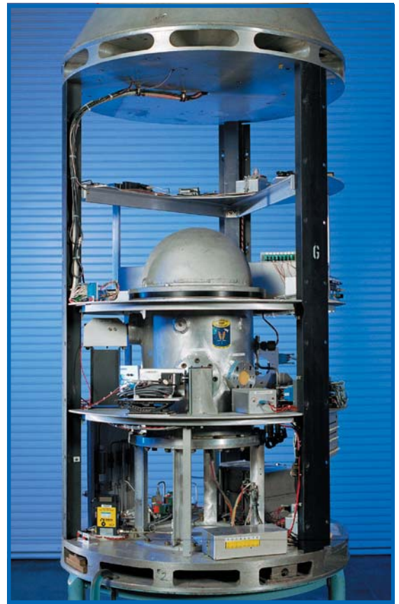
Drop vehicle with gas jet combustion experiment onboard.